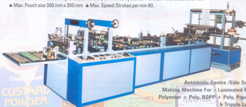
Automatic Centre /Side Seal Pouch Making Machine For :- Laminated Films Like Polyester + Poly, BOPP + Poly, Paper + Poly & Tripple Laminates.